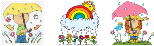
Parish Upcoming Events